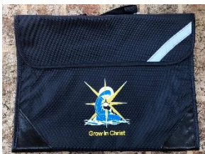
Library Bag (optional)