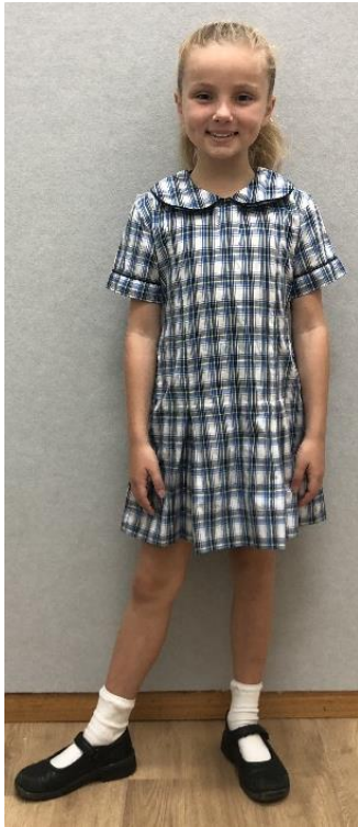
Girls Summer Uniform