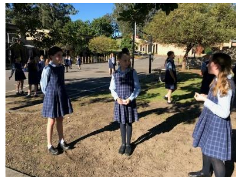
Boys and Girls Specific Social-Emotional learning in Year 6 has been well received by the students.