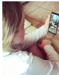
The Power family in action - learning from home